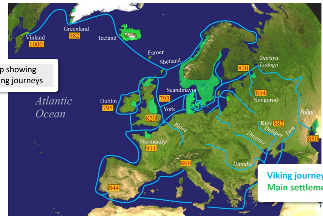
Viking journeys Main settlement areas