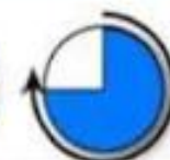
Three quarter turn